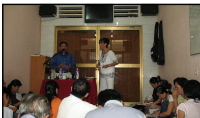
Me teaching at the Bible School

Because Vietnam is a communist country, the school I am going to is underground. What does this mean? I go as a tourist because sharing and teaching the Gospel is a