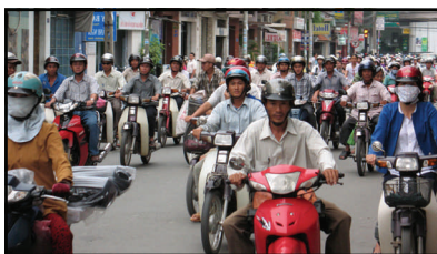
Vietnam is known as Bike World

punishable offense and I could risk imprisonment if caught. I have to be very discreet, I only travel by private scooter to the school, covering my head with a helmet & sunglasses (no taxis - it would be easy to spot our whereabouts), I stay in small hotels where foreigners would not be suspected to stay and most importantly, I try not to bring any attention to myself.